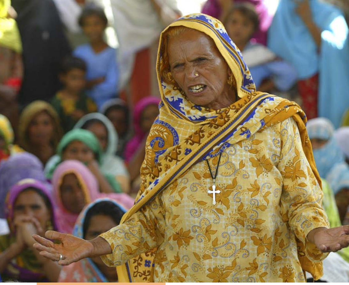
A Christian tenant farmer, South Asia.