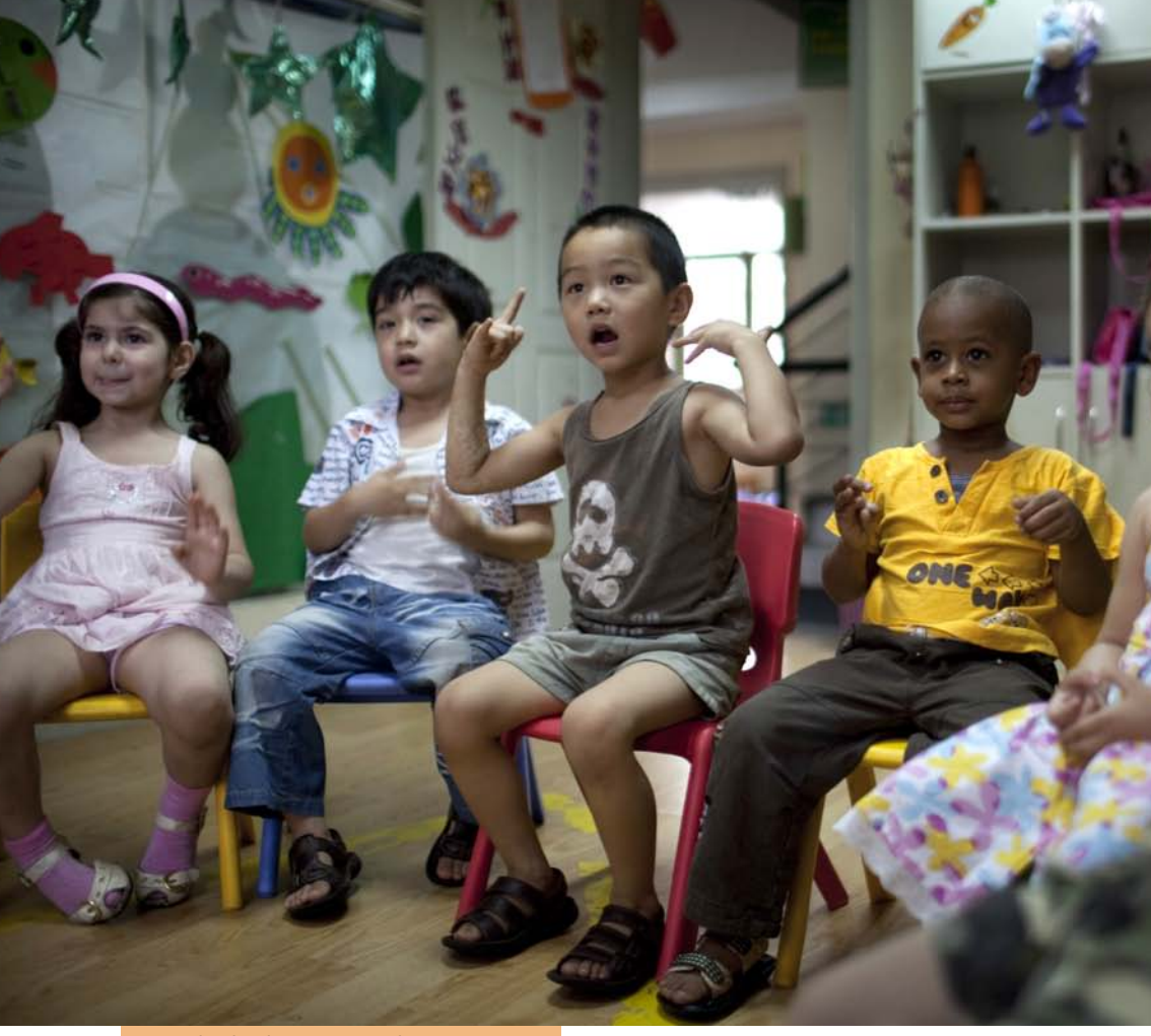
Muslim kindergarten pupils, East Asia.