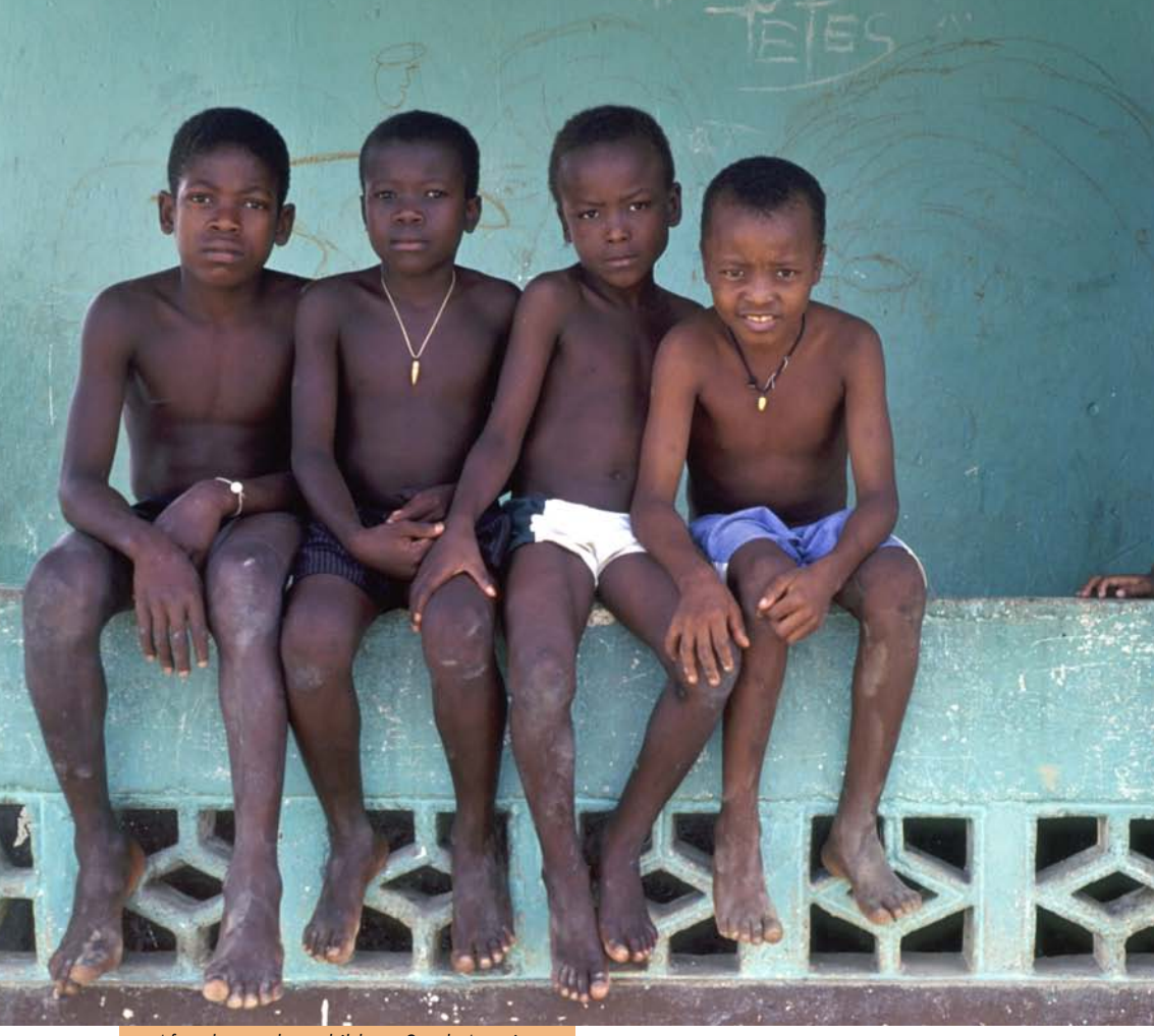
Afro-descendant children, South America.