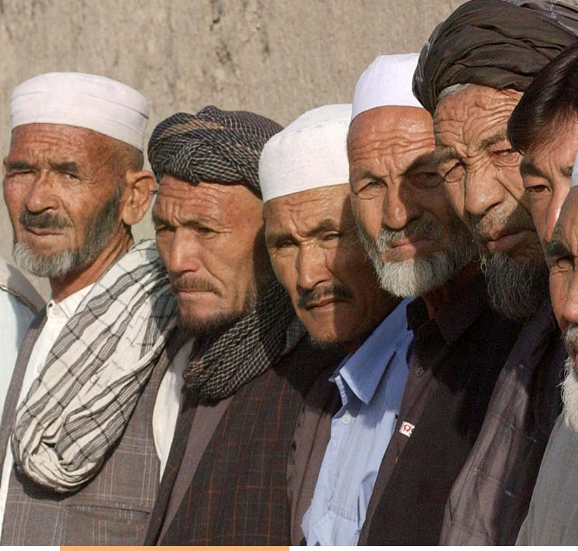
Hazara men queuing to vote, Southern Asia.