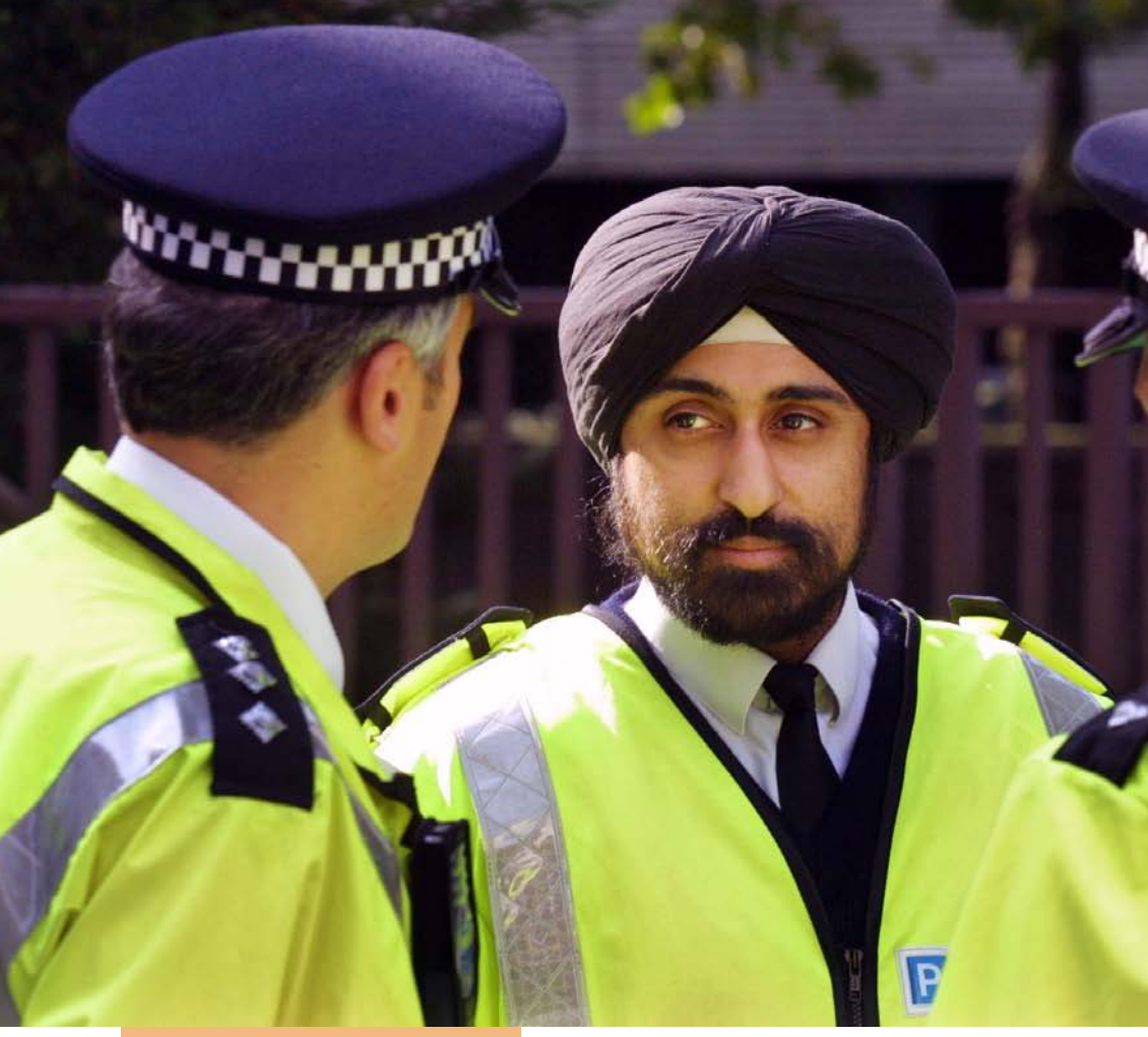
A Sikh police officer, Western Europe.