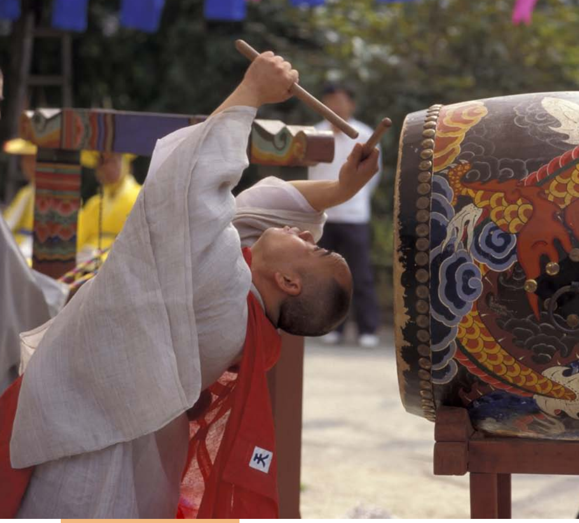
A Buddhist funeral rite, East Asia.